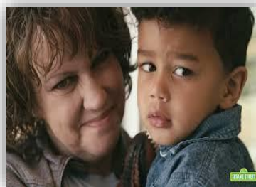
Supporting Military Families After Death by Suicide